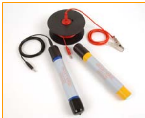
Elcometer 3312 Half-Cell Kits

The gauges store up to 240,000 cover and Half-Cell readings side by side in their extensive memories. Available in models SH and TH, the Elcometer 3312 Covermeter with Half-Cell is perhaps the most versatile and cost effective Covermeter on the market today.