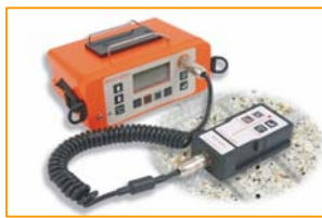
Elcometer 331 2 B Covermeter

Elcometer 331 2 Covermeters with Half-Cell allow users to not only identify the location, orientation, depth and diameter of stainless steel rebar, but also the potential for corrosion all in one easy-to-use gauge.