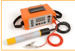
Elcometer 331 2 with Half-Cell & memory

Elcometer 331 2 Covermeters with Half-Cell allow users to not only identify the location, orientation, depth and diameter of stainless steel rebar, but also the potential for corrosion all in one easy-to-use gauge.