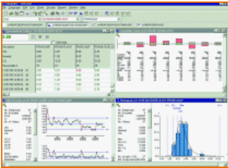
Datastat SPC Software